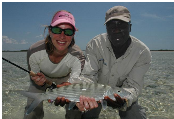
Andros South, South Andros Island, The Bahamas

Come fly fishing for bonefish with some amazing women in an amazing place! Gather your girlfriends, or come alone! Experienced anglers and rookies both welcome.